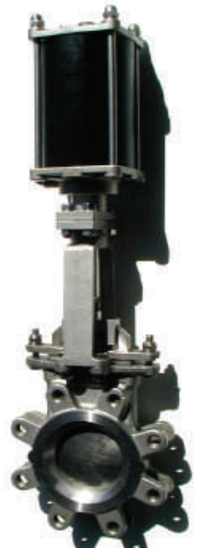
FAILSAFE SYSTEM ~ GENERAL APPLICATION